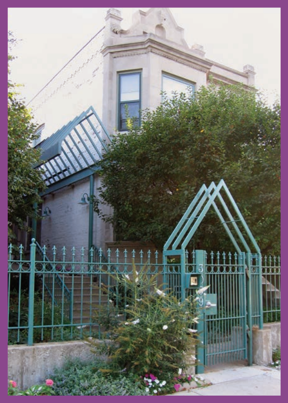
Located in a converted Greystone house on Chicago’s westside, the Residential Center ceased operations in 2020 after 29 years of caring for medically-complex children.

During 2020, Children’s Place Association made the difficult decision to permanently close our original program, the 10-bed Residential Center. Opened in 1991 to provide around-the-clock nursing care for young children with HIV/AIDS, its focus was later widened to serve children with other medically-complex conditions. This pioneering program helped hundreds of children overcome serious illness over its three decades of operation. At a future date, when we are able to gather together, Children’s Place will host an event to honor the Residential Center’s legacy and celebrate the life-changing work that took place there.